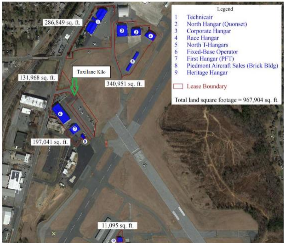
Exhibit A: Premises