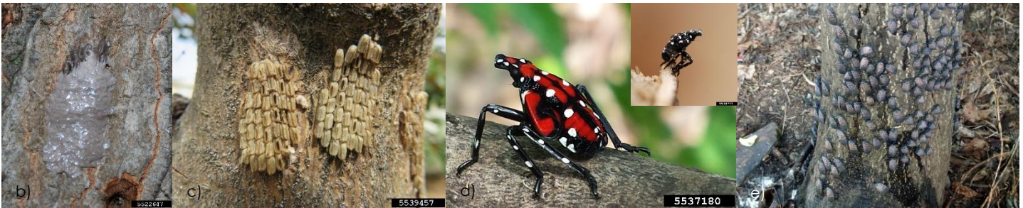
a) Spotted lanternfly adult ; b) Spotted lanternfly egg mass ; c) Spotted lanternfly eggs after hatching ; d) Late stage spotted lanternfly nymph with early stage nymph in inset ; e) Spotted lanternfly adults on Ailanthus with damage to tree evident in weeping wounds

Spotted lanternfly, Lycorma delicatula (White), is an invasive planthopper that was first detected in the United States in Berks County, Pennsylvania, in 2014. The pest is native to northern China and was introduced to Korea in 2004 where it has become a major pest. This pest is not known to occur in North Carolina but early detection is critical for protecting North Carolina businesses and agriculture.